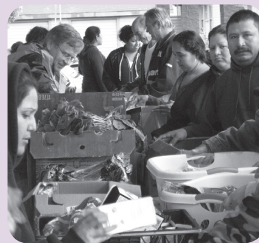
Outreach Begins in Guadalupe