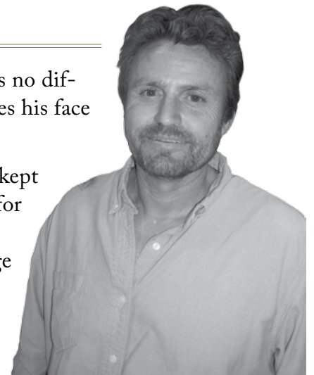
Keep Leon in your prayers – God is ready to do big work!

Please keep people like Leon in your prayers –to see them make the right choice and get off the streets.